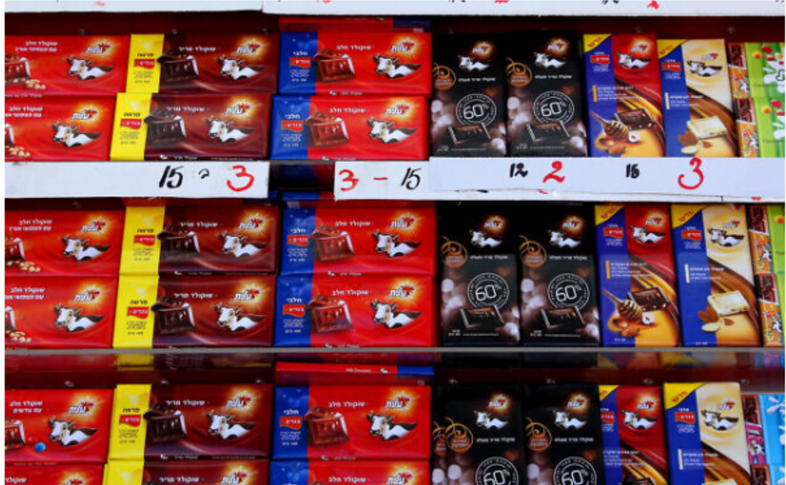
An illustrative photo showing chocolate bars made by Strauss Group.

The massive recall of food products announced last week by Strauss Group, one of Israel's largest food manufacturers, also applies to products the company sells to retailers abroad.