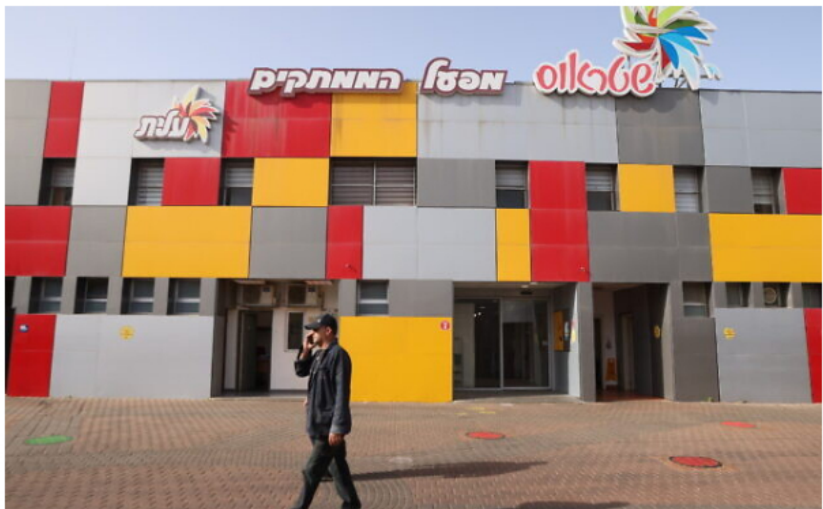
View of the Strauss Elite candy factory in Nof Hagalil, northern Israel, April 28, 2022.

Last Thursday, on April 28, the US Food and Drug Administration (FDA) posted Strauss' announcement of a voluntary recall that includes "all product codes currently on the US market." These products were distributed and sold in retail chains, like Walmart, in places where there is demand for kosher products, primarily in New York, New Jersey, Connecticut, California, and Florida, according to the announcement. Items are also sold online via e-commerce sites like Amazon.