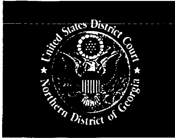
EXHIBIT / ATTACHMENT